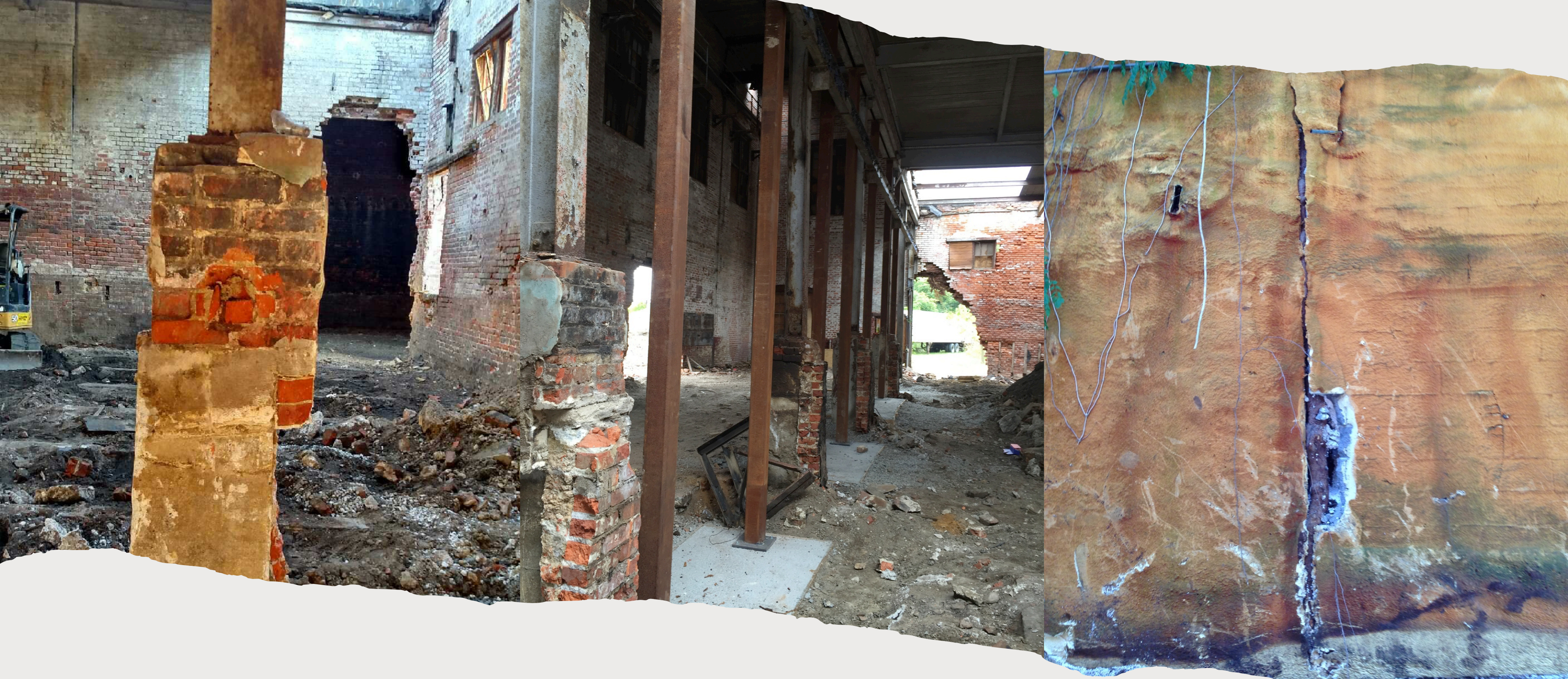
Ice House – A Structural Nightmare