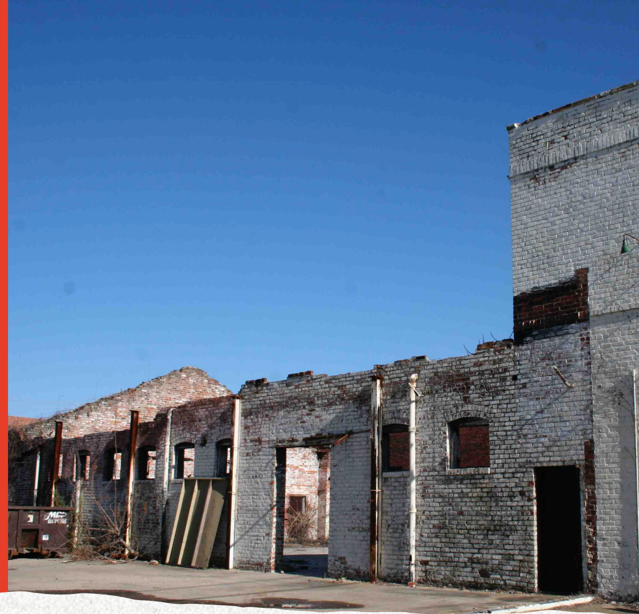
Southern Express Building 215 E Bank St Circa 2012